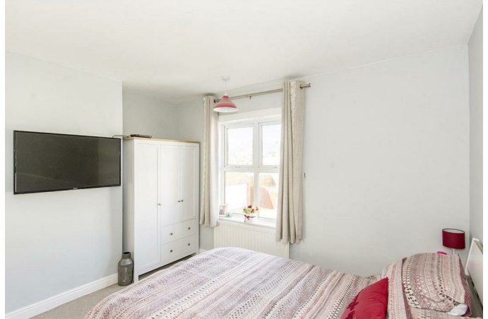
Bedroom One 12'3" x 10'6" (3.73m x 3.20m)

Double-glazed window to front elevation. Built-in wardrobe. Radiator. Television point.