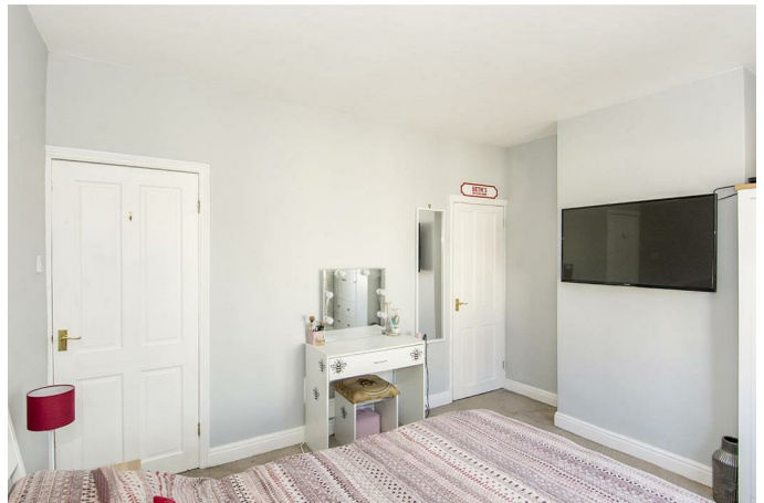
(Bedroom One Photo Two)

Double-glazed window to front elevation. Built-in wardrobe. Radiator. Television point.