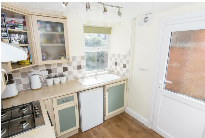
(Kitchen Photo Two)

Fitted base and wall units. Laminated work-surfaces and splash-backs. Fitted oven and four-ring gas hob with extractor fan over. Space and point for under-counter refrigerator. Enameled sink and drainer. Wood effect vinyl flooring. Radiator. Double-glazed window to rear elevation. Opaque double-glazed door to rear garden.